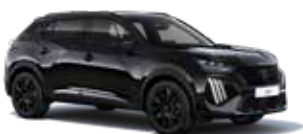
Nera Black (M09V) metallic $550