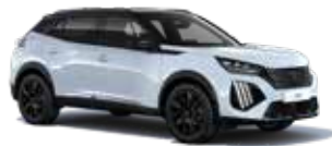
Okenite White (M0SU) metallic $550