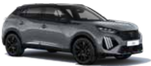
Selenium Grey (MOLD) metallic $0