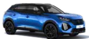
Vertigo Blue (M6SM) pearlescent $950