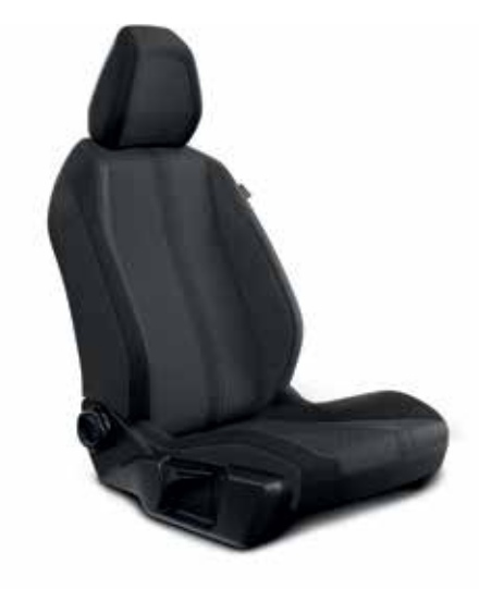
'Casual Lomsa' Seat Trim Standard