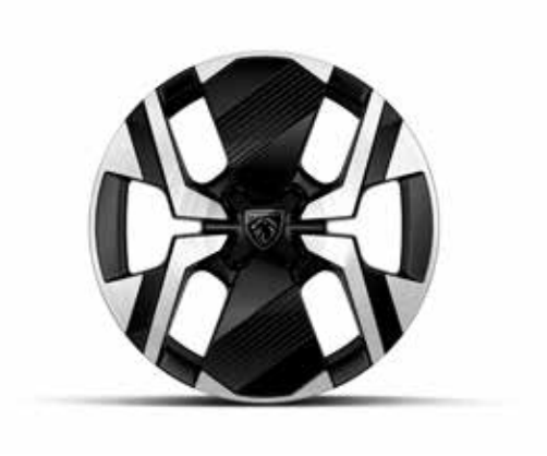
17" 'KARAKOY' Alloy Wheels (DZHL3) Diamond Cut